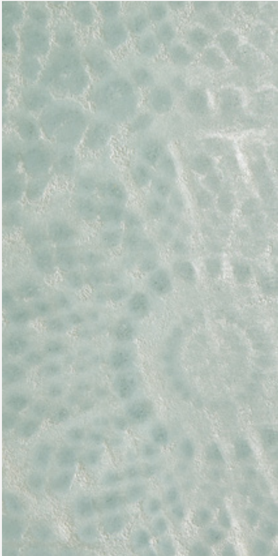
CALCECRUDA 17027 & CERA SILVER