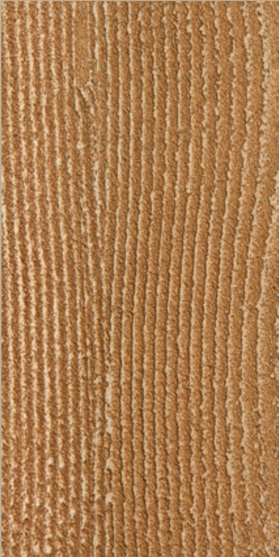
CALCECRUDA 17023 & CERA BRONZE