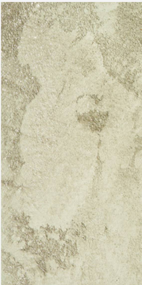
CALCECRUDA 17026 & CERA SILVERMICA