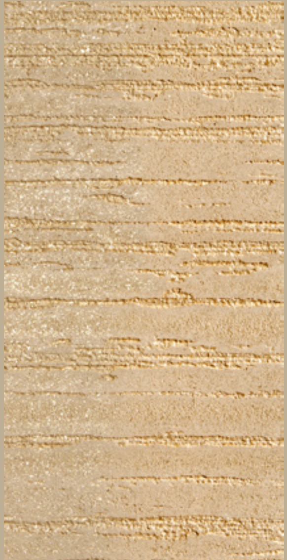
MARMUR FINE 15027 & CERA GOLDMICA