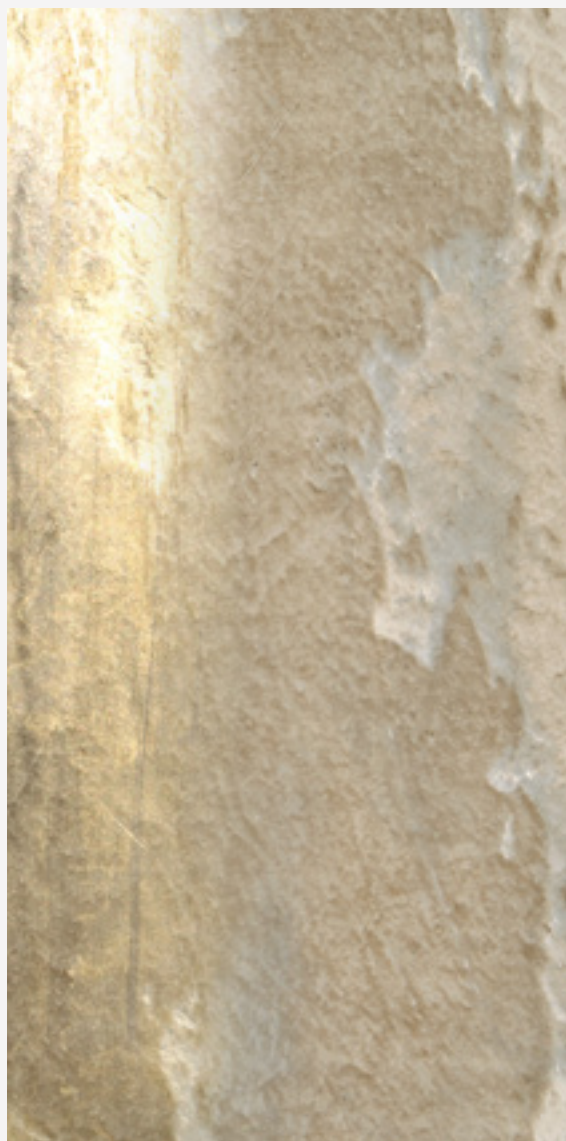
MARMUR FINE 15027 & FLORENZIA EV957 & CERA GOLD