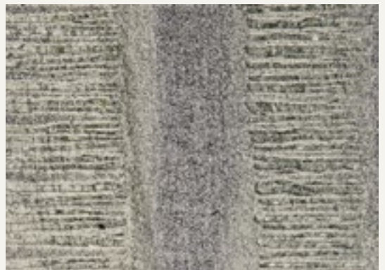
R-STONE FONDO BIANCO + R-STONE BLU + R-STONE PERLA 17405