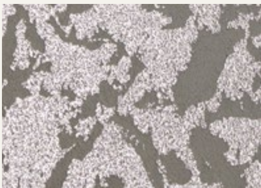
R-STONE FONDO 17302 + R-STONE METAL SILVER