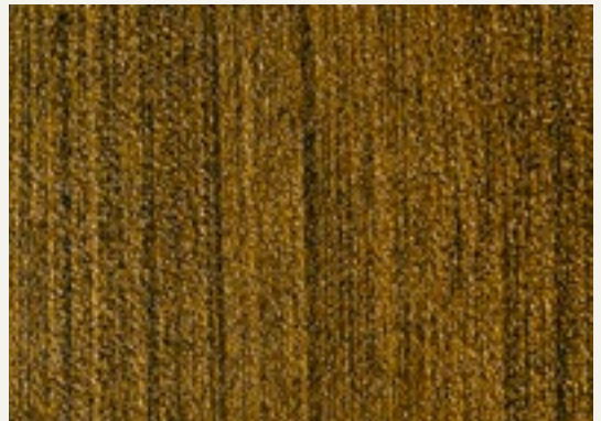
R-STONE FONDO BIANCO + R-STONE METAL GOLD + R-STONE PERLA 17402