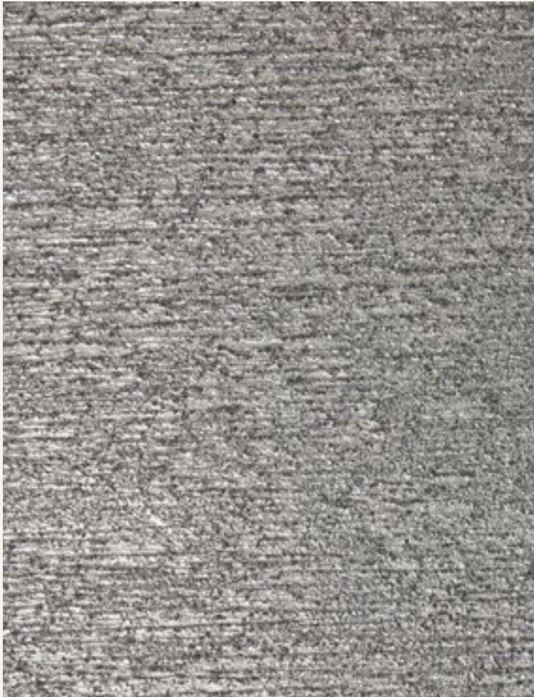
R-STONE FONDO 17300 + R-STONE METAL SILVER + R-STONE PERLA 17400