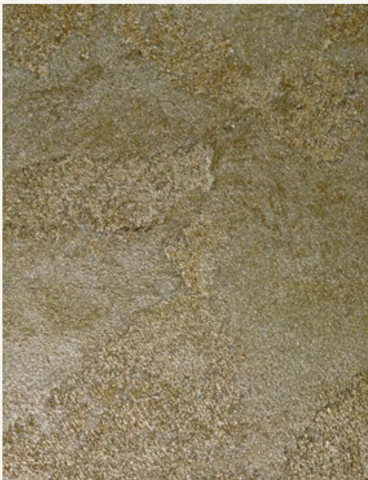
R-STONE FONDO 17302 + R-STONE METAL SILVER + R-STONE VERDE