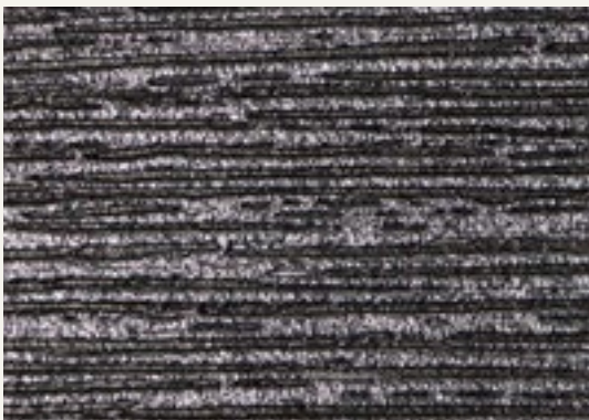
R-STONE FONDO 17300 + R-STONE PERLA 17402 + R-STONE METAL SILVER