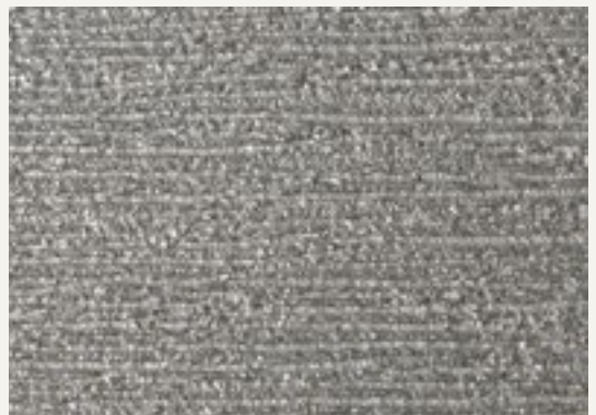
R-STONE FONDO 17302 + R-STONE METAL SILVER