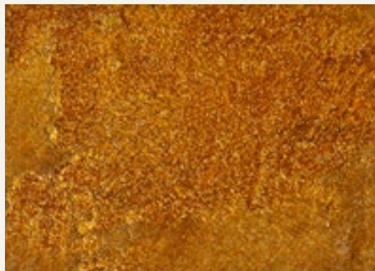
R-STONE FONDO 17302 + R-STONE METAL GOLD + R-STONE ROSSO

Colours and patterns illustrated are for guidance only. The exact pattern, colours and shades may vary from those shown.