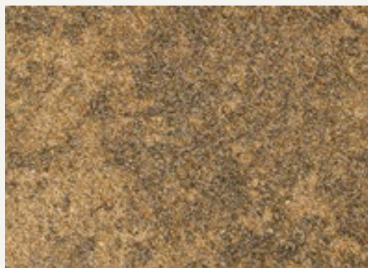
R-STONE FONDO 17301 + R-STONE PERLA 17401 + R-STONE PERLA 17400