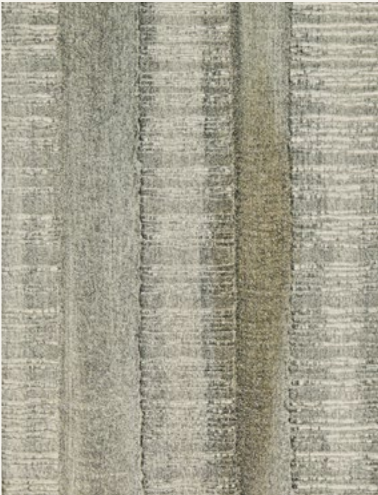
R-STONE FONDO BIANCO + R-STONE PERLA 17406 + R-STONE PERLA 17405