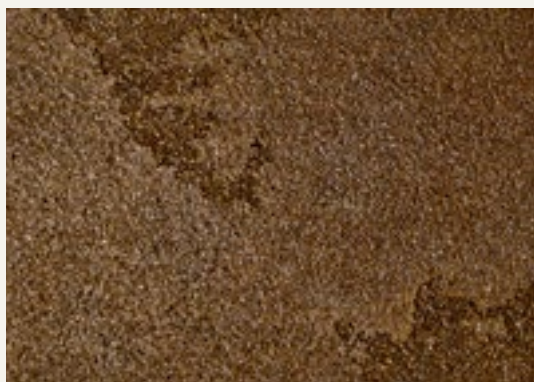
R-STONE FONDO 17302 + R-STONE ROSSO