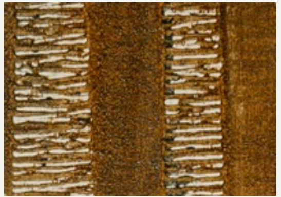
R-STONE FONDO BIANCO + R-STONE ROSSO + R-STONE PERLA 17402