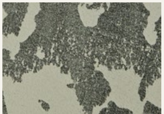
R-STONE FONDO 17303 + R-STONE PERLA 17405