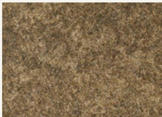
R-STONE FONDO 17301 + R-STONE PERLA 17404 + R-STONE PERLA 17403