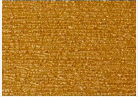
R-STONE FONDO BIANCO + R-STONE METAL GOLD