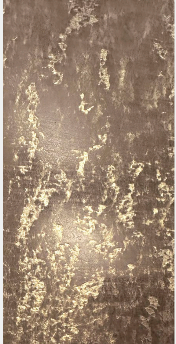
MARMUR FINE 15027 & FLORENZIA EV957 & CERA WAX GOLD