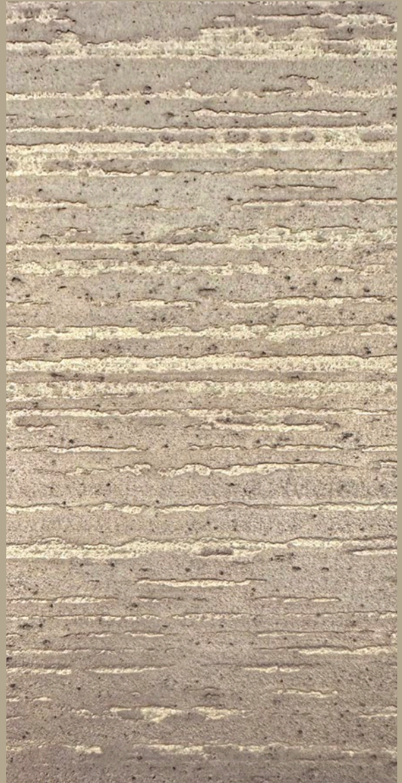
MARMUR FINE 15027 & CERA WAX GOLD