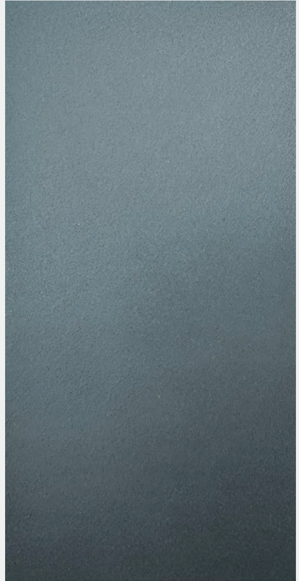
MARMORINO KS 20131 & CERA WAX PLUS