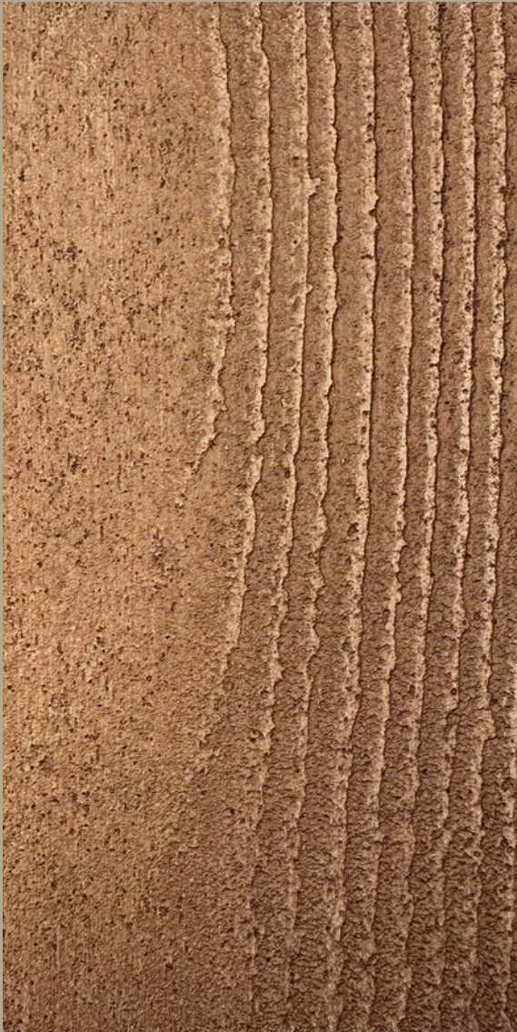
CALCECRUDA 17023 & CERA WAX BRONZE